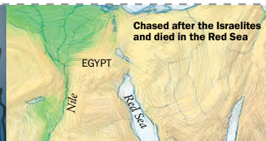
Chased after the Israelites and died in the Red Sea