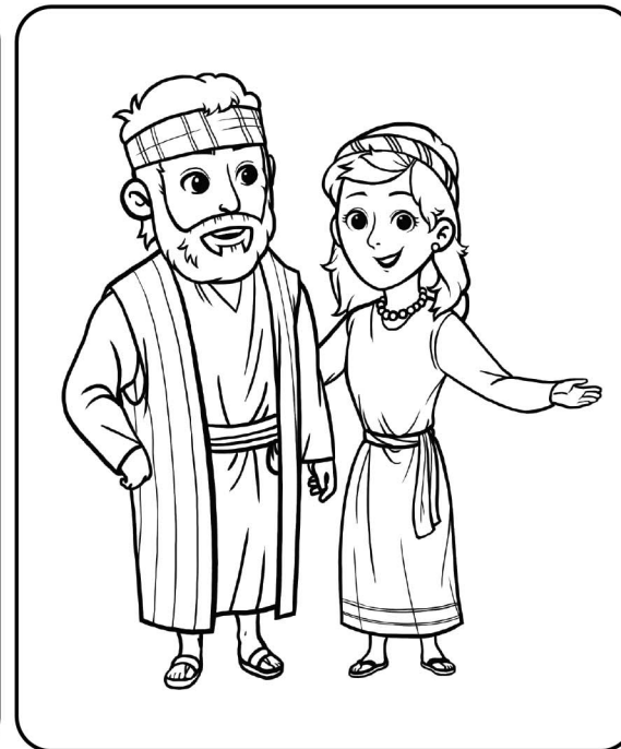
Akuila le Prisilla Lamkaltu 18:1-3, 18-19

Thitumnak he aa tlaimi Jehovah phunglam cu aa thleng maw?