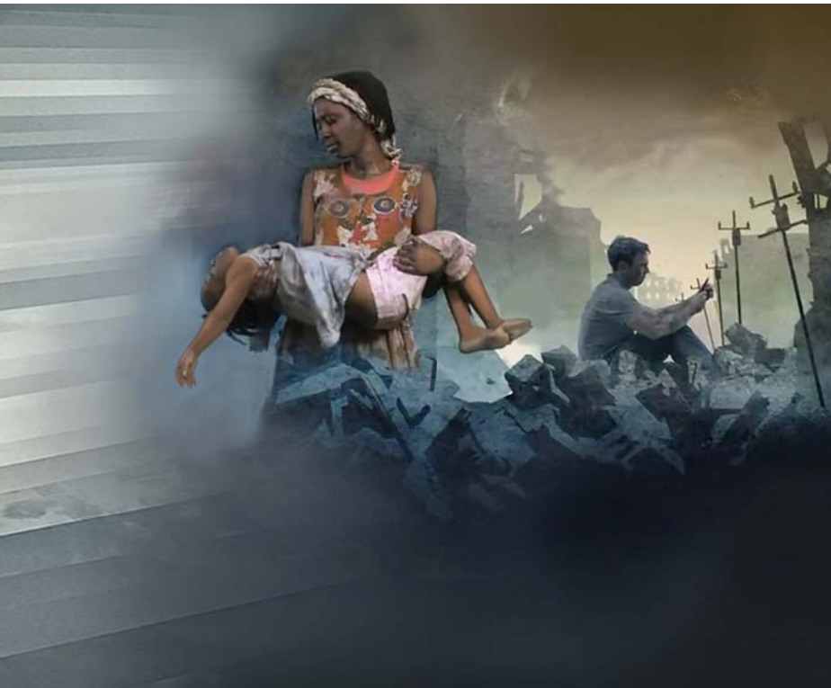
Tam ma Adam ki Kawa gumoko-ni okelo peko keken! (Nen paragraf me 9-12)