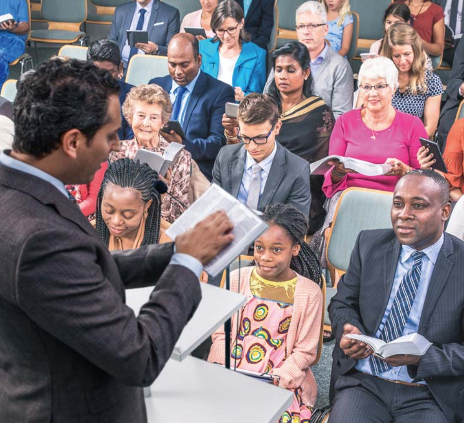
Waraga ma lukwena gucoyo ocuko cwiny Lukricitayo i cencwari me acel, dok pud cuko cwinywa wa i kare-ni (Nen paragraf 12-17)

pa Yecu. Buk ma en ocoyo-ni ocuko cwiny Lukricitayo pi mwaki miya ma-pol dok pud medde ki cuko cwinywa i kare-ni. Me labolle, i Jiri pa Jon keken aye wakwano lok pa Yecu ni mar aye gin ma nyuto Lukricitayo me ada. — Kwan Jon 13:34, 35.