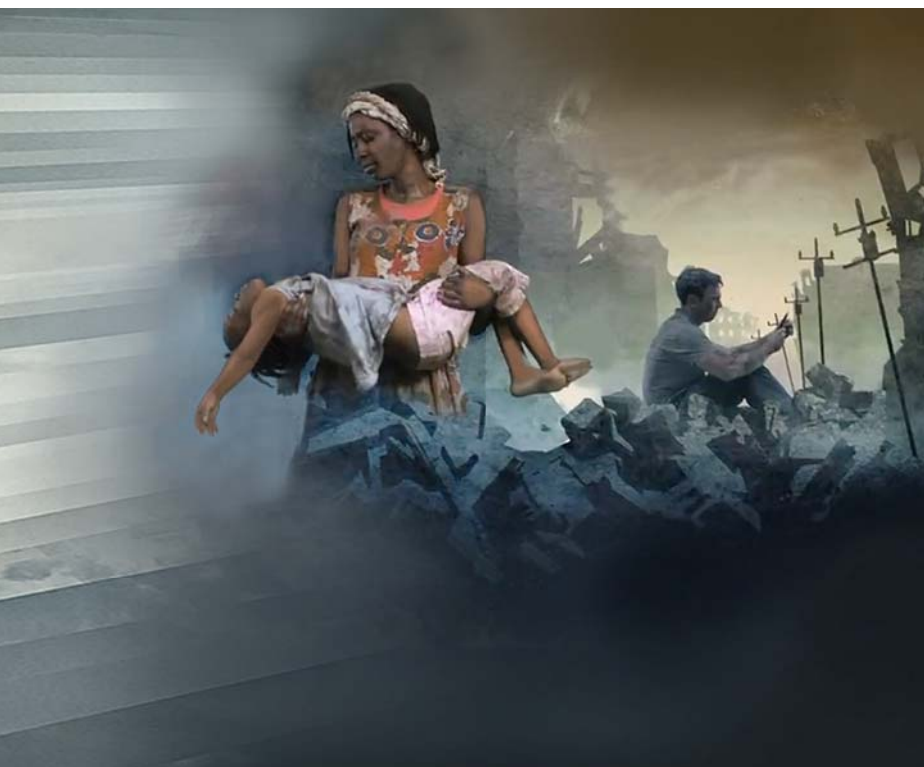
Adam and Eve's choice led to disaster! (See paragraphs 9-12)

bad. Instead, they lost the true freedom Jehovah had given them.