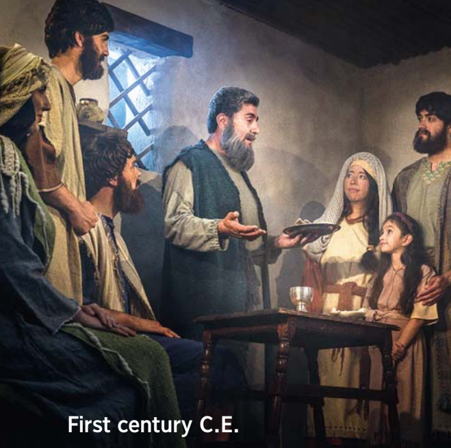
First century C.E.