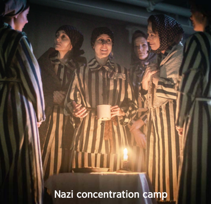
Nazi concentration camp