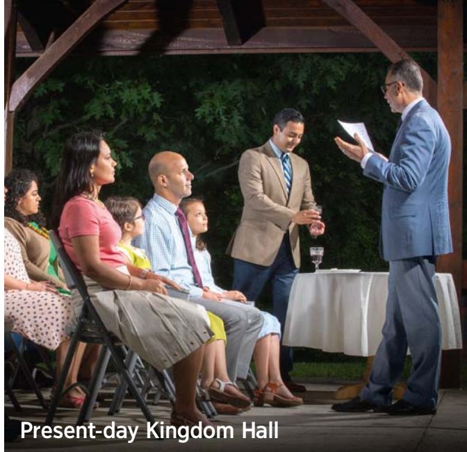
Present-day Kingdom Hall

tions?’ May we always imitate Jesus and show “fellow feeling.”—1 Pet. 3:8.