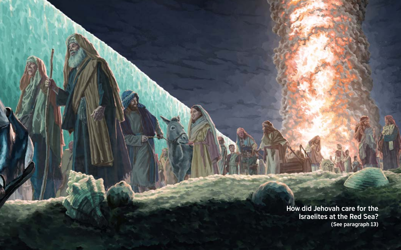
How did Jehovah care for the Israelites at the Red Sea? (See paragraph 13)

that reassurance because of what happened next.