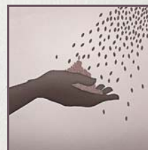
Verse 16 —There will be plenty of food for everyone