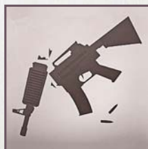
Verse 14 —Violence will not exist