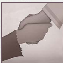
Verse 12 —The poor will be rescued