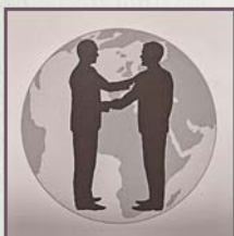
Verse 3 —Everyone will have peace

Our zeal moves us to tell others what the Kingdom will do for mankind