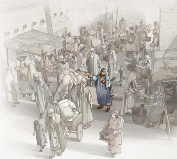
The proud scribes and Pharisees loved to be noticed and greeted in the marketplace