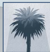
a shade from the sun