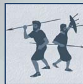
a loyal soldier