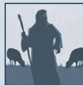
a wide-awake shepherd

Jehovah’s protection is described in word pictures such as . . .