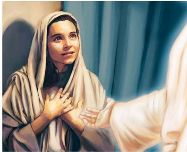
'Onani! Ndine ndzakazi wa Yahova!' (Onani ndima 13, 14)

13, 14. Thangwi yanji basa idapaswa Mariya ikhali yakunentsa kakamwe, mbwenye iye atawira tani mafala a anju Gabryele?