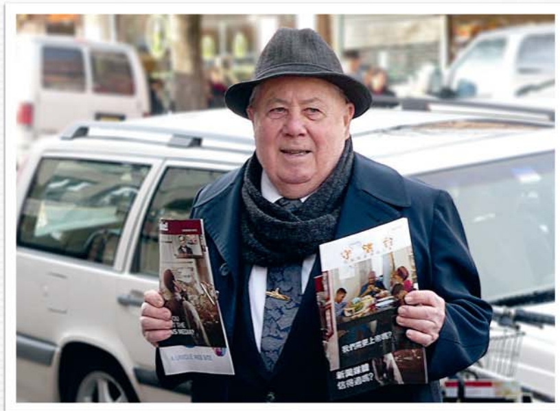
Kumwaza mphangwa kuna anthu analonga Cixina ku Brooklyn, Nova York