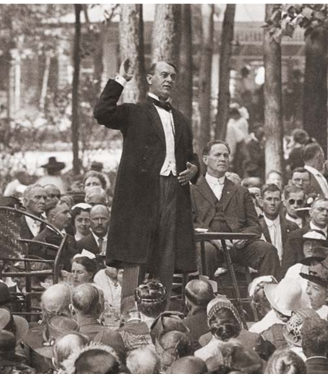
Brother Rutherford speaking at the Cedar Point, Ohio, convention, 1919

The circumstances surrounding the trial of our brothers may give indication of Jehovah’s direction. On May 14, 1919, the appeals court ruled: “The defendants in this case did not have the . . . impartial trial to which they were entitled, and for that reason the judgment is reversed.” The brothers had been convicted of serious crimes, and these judgments would have remained on their records if they had only been pardoned or if their sentences had merely been commuted. No further charges were laid. As a result, Judge Rutherford retained his legal qualifications to defend Jehovah’s people before the Supreme Court of the United States, something he did many times after his release.