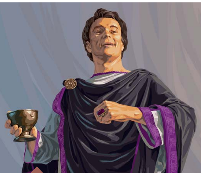
HOW SOME LAODICEANS SAW THEMSELVES . . .

6. What lesson can we learn from Jesus' words to the congregation in Laodicea?