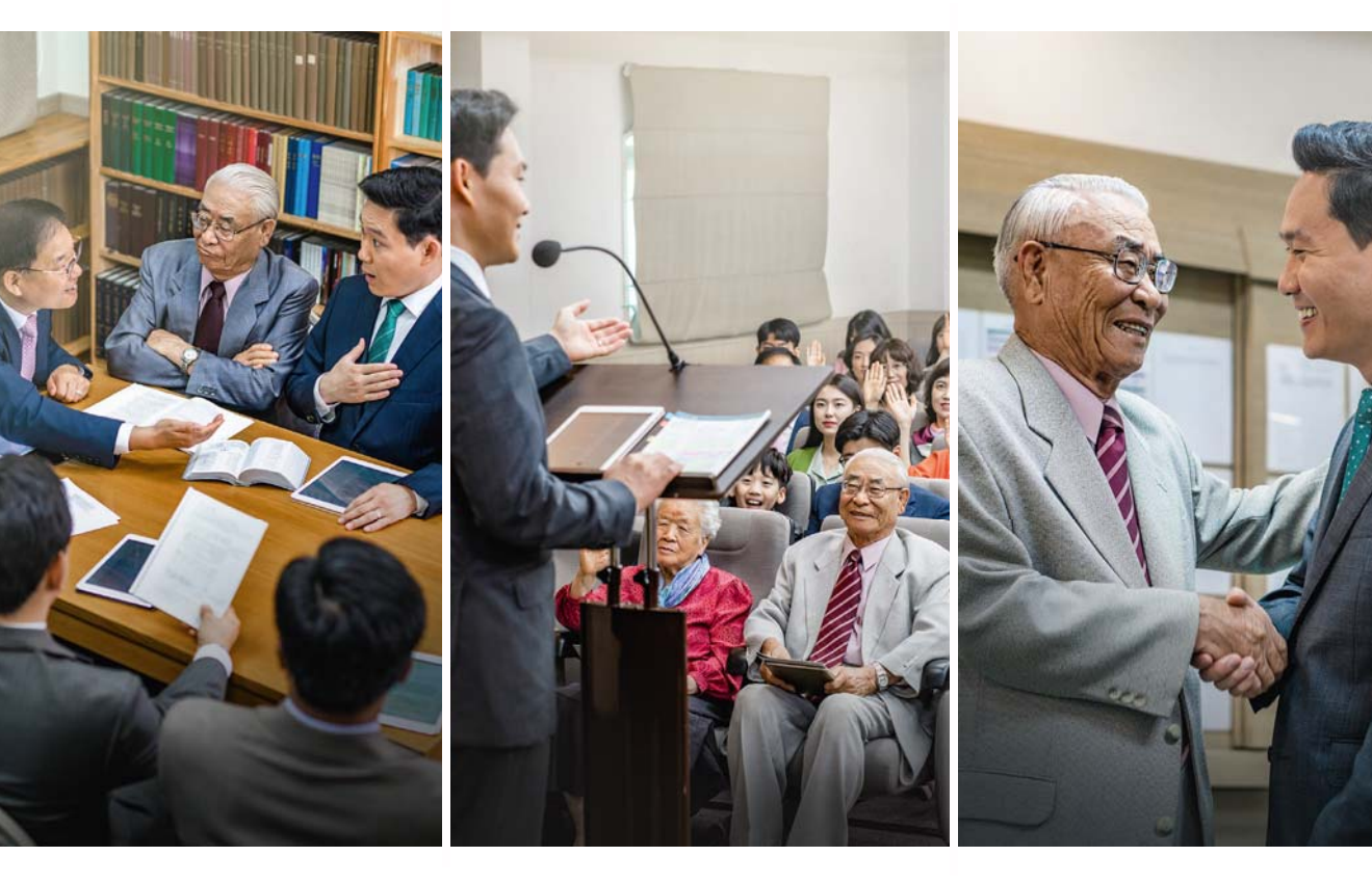
How can Christian elders imitate the humble disposition of Moses? (See paragraphs 11-12)

<sup>12</sup> Consider another situation that many older brothers are facing. For several decades, they have served as coordinators of the bodies of elders. But when they turn 80, they willingly give up their assignment. Circuit overseers who reach 70 years of age humbly give up that privilege and accept their