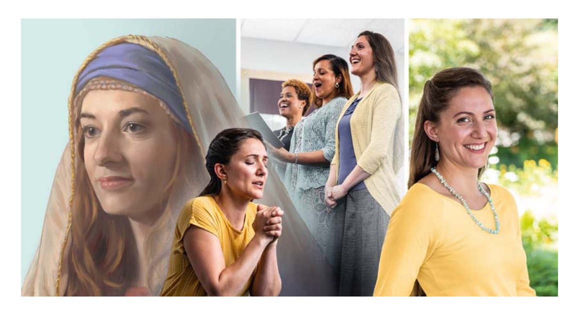
Like Hannah in the past, how can we today regain and maintain our inner peace? (See paragraphs 6-10)

Prayer and meetings are key ways that Jehovah uses to soothe us. (Heb. 10:24, 25) Note another lesson we can learn from Hannah's experience.