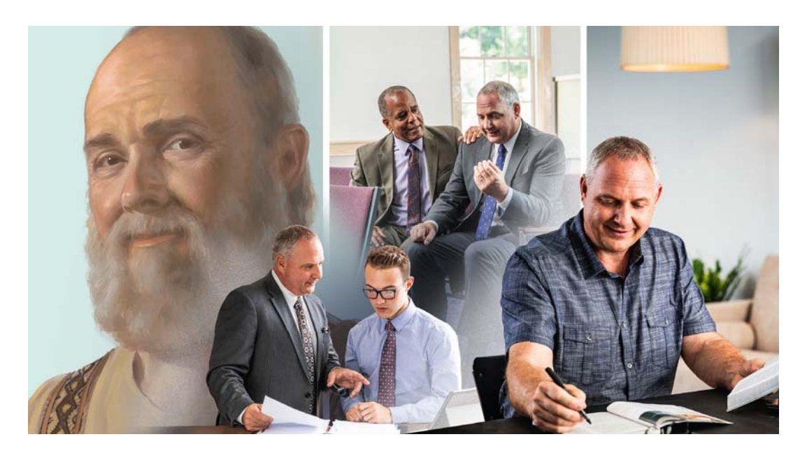
As we learn from the example of the apostle Paul, what can we do to avoid being overwhelmed by anxiety? (See paragraphs 13-15)

fort on hearing of your love." (Philem. 7) Paul mentioned several other fellow workers who had greatly encouraged him during times of distress. (Col. 4:7-11) When we humbly acknowledge that we need encouragement, our brothers and sisters will gladly give us the support we need.