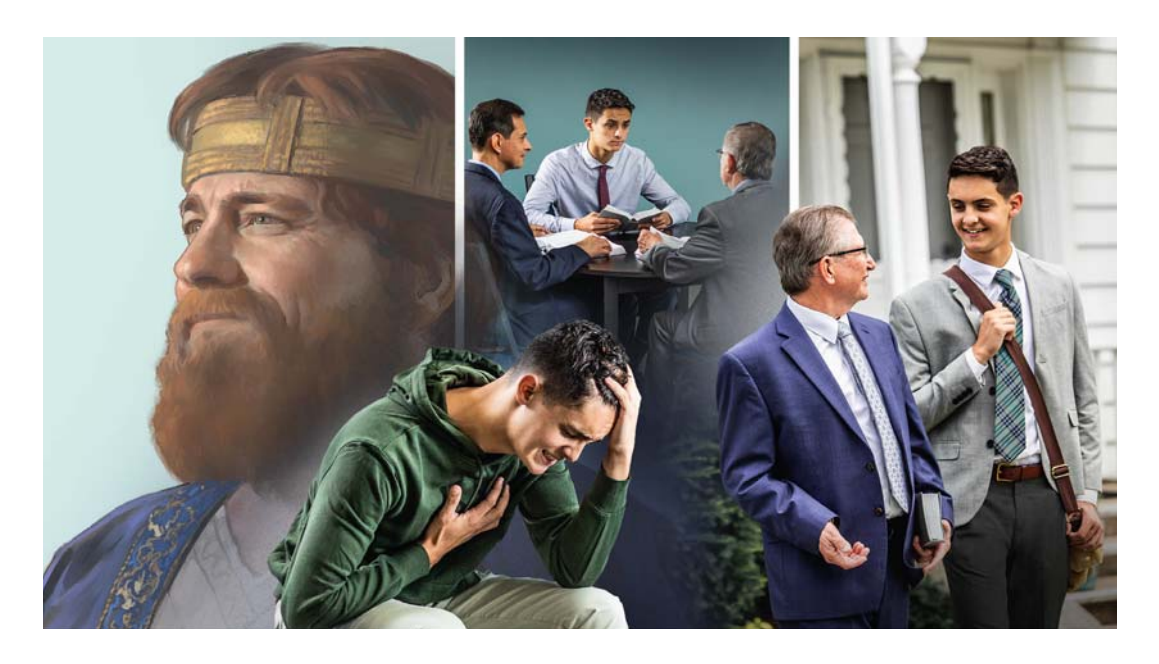
As in the case of King David, what can help us if we make a serious mistake? (See paragraphs 16-19)

relief that finally brought him! (Ps. 32:1, 2, 4, 5) If you commit a serious sin, do not try to cover the error. Instead, openly confess your sin to Jehovah in prayer. You will then begin to feel some relief from the anxiety caused by a guilty conscience. But if you want to restore your friendship with Jehovah, you need to do more than pray.