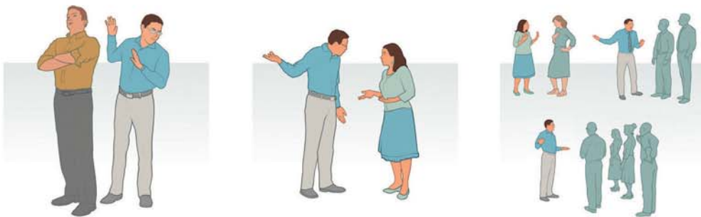
Kuvuga abandi nabi bishobora gutuma ibintu birushaho kuzamba (Reba paragarafu ya 14)