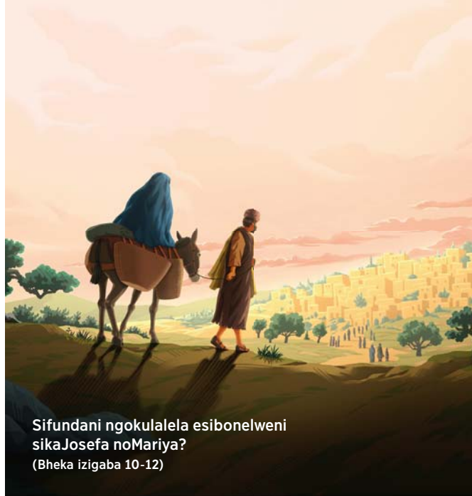
Sifundani ngokulalela esibonelweni sikaJosefa noMariya? (Bheka izigaba 10-12)

9. Abaningi bazizwa kanjani ngokulalela umthetho?