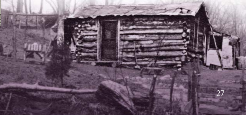
The log cabin where I was born

My mother was very religious. She took us to the Baptist church every Sunday. When I was 12,