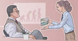
The belt of truth (See paragraphs 3-5)