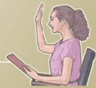
The large shield of faith (See paragraphs 12-14)