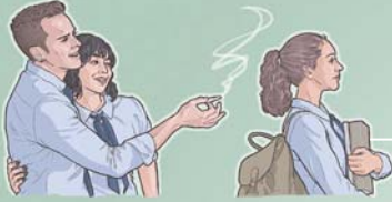
The breastplate of righteousness (See paragraphs 6-8)

ARE YOU WEARING EACH PIECE OF YOUR SUIT OF ARMOR?