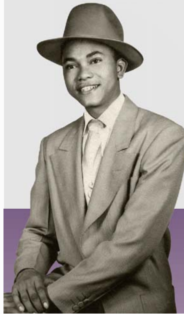
1952 At age 17, before I entered the army

I regretted saying that, but I felt that I could not break my promise. So that night I went to the meeting. The children impressed me the most. I couldn’t believe how much they knew about the Bible! Even though I had gone to church with my mother every Sunday, I still knew very little about the Bible. Now I really wanted to learn more, so I agreed to have a Bible study. One of the first things I learned was that the personal name of God Almighty is Jehovah. Years before, when I asked my mother about Jehovah’s Witnesses, she simply said, “Oh, they worship some old man named Jehovah.” But I now felt that my eyes were being opened!