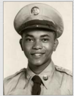
1954-1956 I spent two years in the U.S. Army

Before I learned the truth, I had the wrong idea of what a real man should be like. I was influenced by movies and by those around me. I thought that men who talked about the Bible were not manly. But I began to learn some things that changed my life. One day, while I was driving my fancy red car through town, two young women waved at me to come over to them. They were the younger sisters of the man who had married my older sister. These two young ladies were Jehovah’s Witnesses. I had accepted the Watchtower and Awake! magazines from them before, but I felt that The Watchtower was a bit too difficult to understand. This time, however, they invited me to come to a Congregation Book Study, a small meeting for Bible study and discussion that was held in their home. I told them I would think about it. They smiled and asked, “Do you promise?” I said, “I promise.”