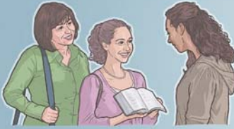
The sword of the spirit (See paragraphs 19-20)