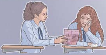
Feet shod in readiness (See paragraphs 9-11)