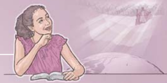
The helmet of salvation (See paragraphs 15-18)