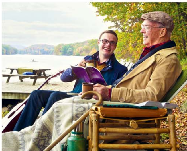
Be kind like Jehovah (See paragraph 7)

imagined how they would feel about what he might say or do. For example, a woman who had done many bad things came to Jesus. She was crying so much that her tears fell on Jesus' feet. Jesus could see that she felt very sorry about the bad things she had done and that she had repented. He realized that if he was unkind to her, she would feel even worse. So he praised her for the good she did and forgave her. Jesus also spoke kindly to a Pharisee who did not agree with what he had done for this woman.—Luke 7:36-48.