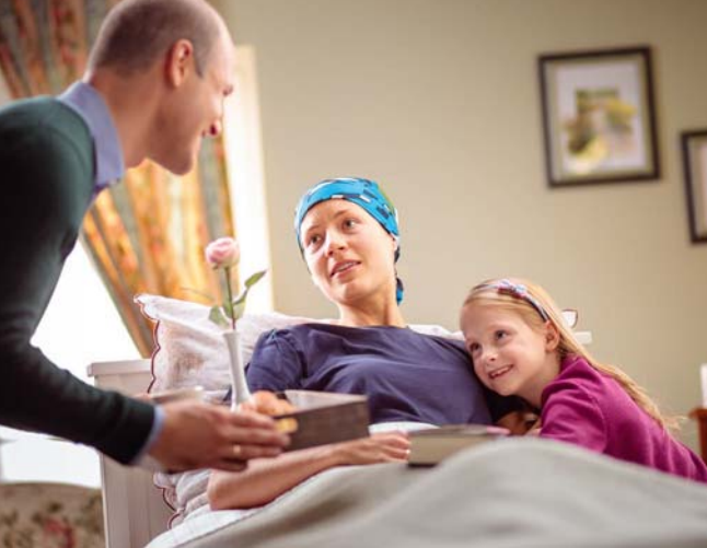
A Christian puts the needs of others first —especially those of his marriage mate (See paragraph 12)