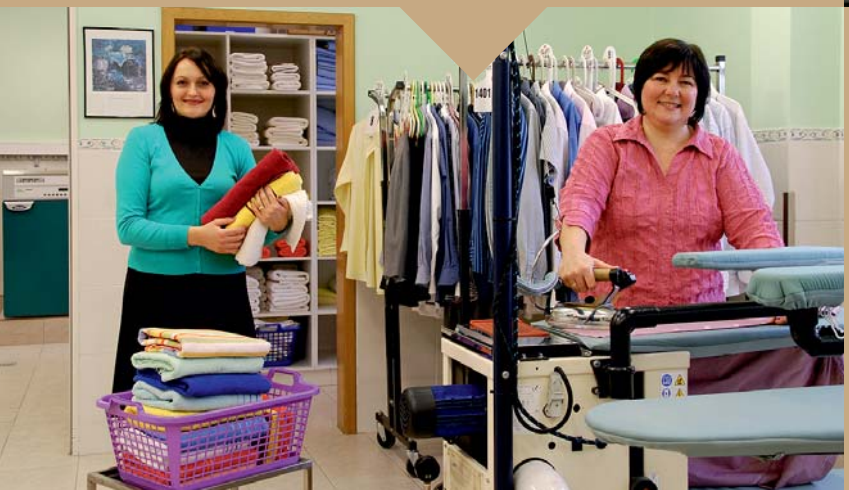
Those serving at Bethel are happy to use their time, energy, and abilities to support the worldwide work of Kingdom preaching. Family members assigned to care for cleaning, housekeeping, and laundry help to maintain the family's high standard of cleanliness—a distinguishing mark of Bethel homes around the world.