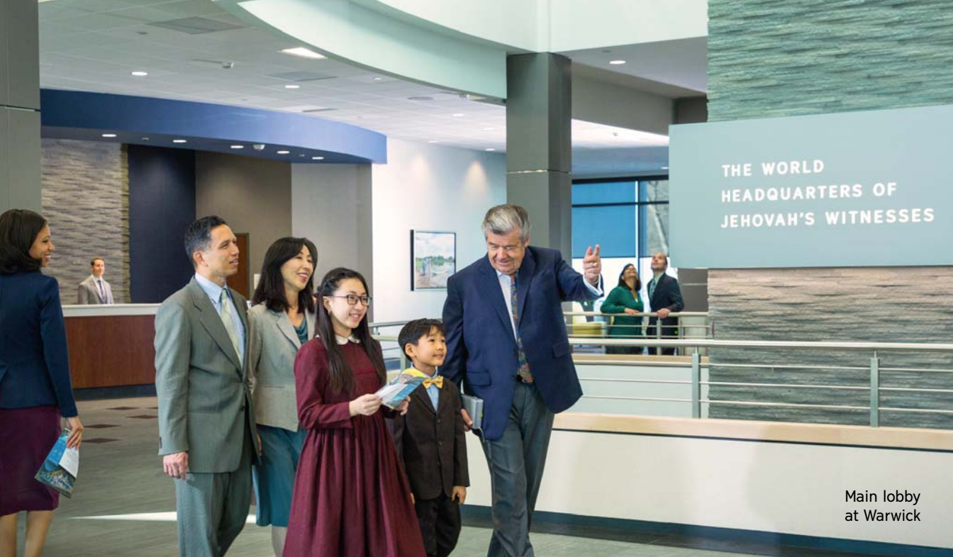
Main lobby at Warwick