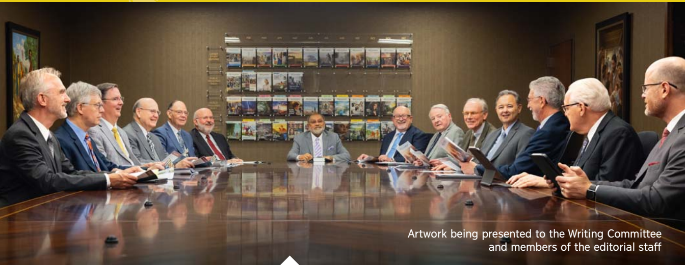
Artwork being presented to the Writing Committee and members of the editorial staff

There are six committees of the Governing Body. In caring for Kingdom interests, each committee has a specific area of oversight. It is through these six committees that Jehovah’s people receive spiritual shepherding.