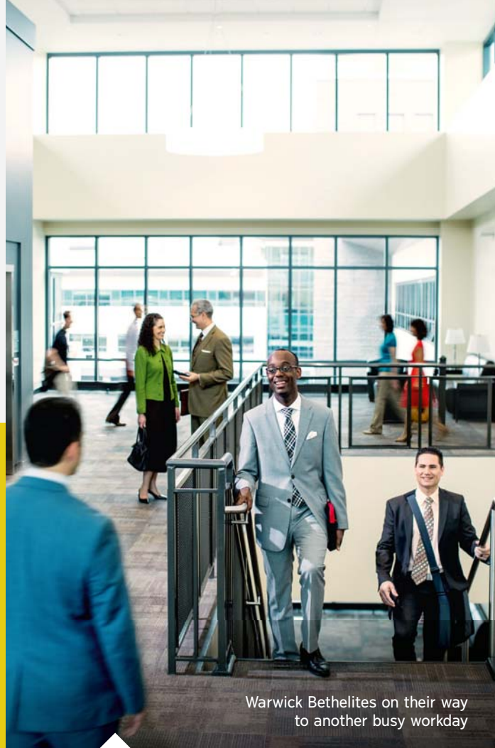
Warwick Bethelites on their way to another busy workday