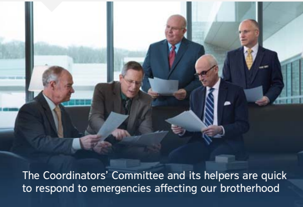
The Coordinators' Committee and its helpers are quick to respond to emergencies affecting our brotherhood