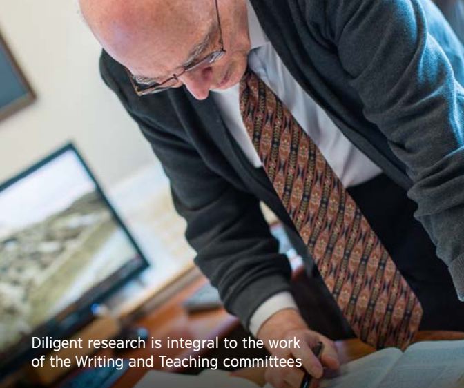
Diligent research is integral to the work of the Writing and Teaching committees