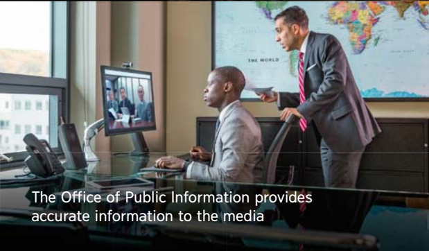
The Office of Public Information provides accurate information to the media