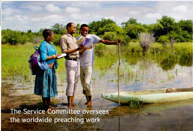
The Service Committee oversees the worldwide preaching work