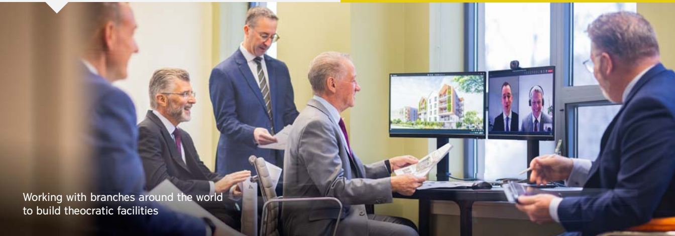
Working with branches around the world to build theocratic facilities