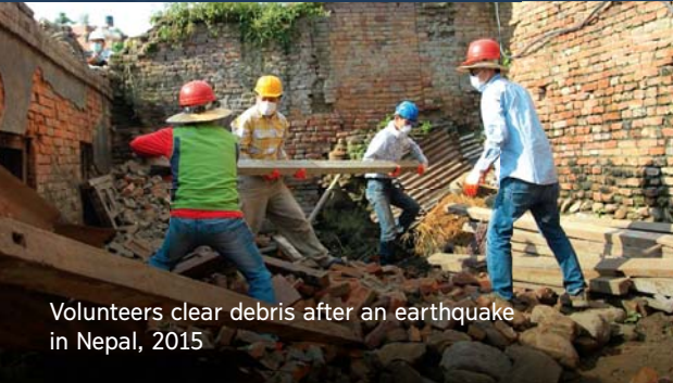
Volunteers clear debris after an earthquake in Nepal, 2015